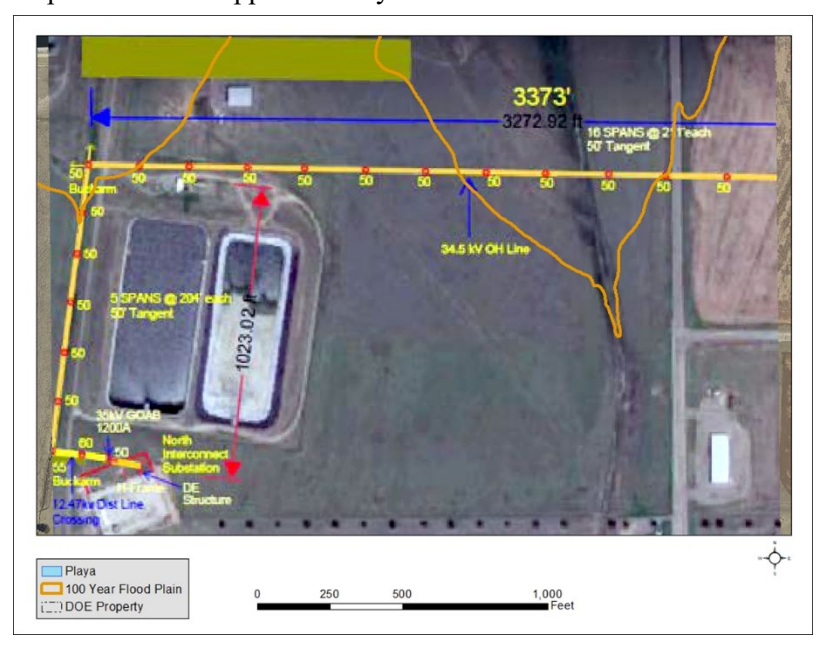
Figure- Map of impacted Playa 1 Floodplain Area

The floodplain impacts of this project are those identified from the project description that would or could modify the existing conditions of the Playa 1