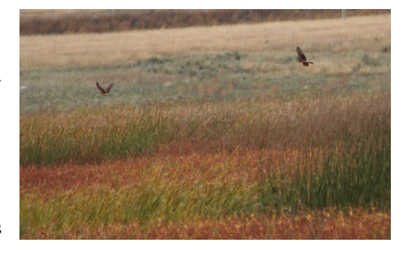
Figure 2- Northern Harriers Hunting Over Playa 1

Installation of power poles, guy lines, and site restoration activities of this project have the potential to impact the floodplain at Playa 1. Approximately 0.007 acres of floodplain at Playa 1, less than 0.004 percent of the Playa 1 floodplain area, would be impacted by the installation activities of this project. The installation of the power poles and guy lines has the potential to displace approximately 0.0000368 acre inches of floodplain volume, which would raise the floodplain elevation less than 0.00000307 feet at Playa 1. Even this minor volumetric change would be defined as a negative, direct, and long-term effect on existing conditions. Storm water runoff may have the potential to erode denuded areas and transport sediments during