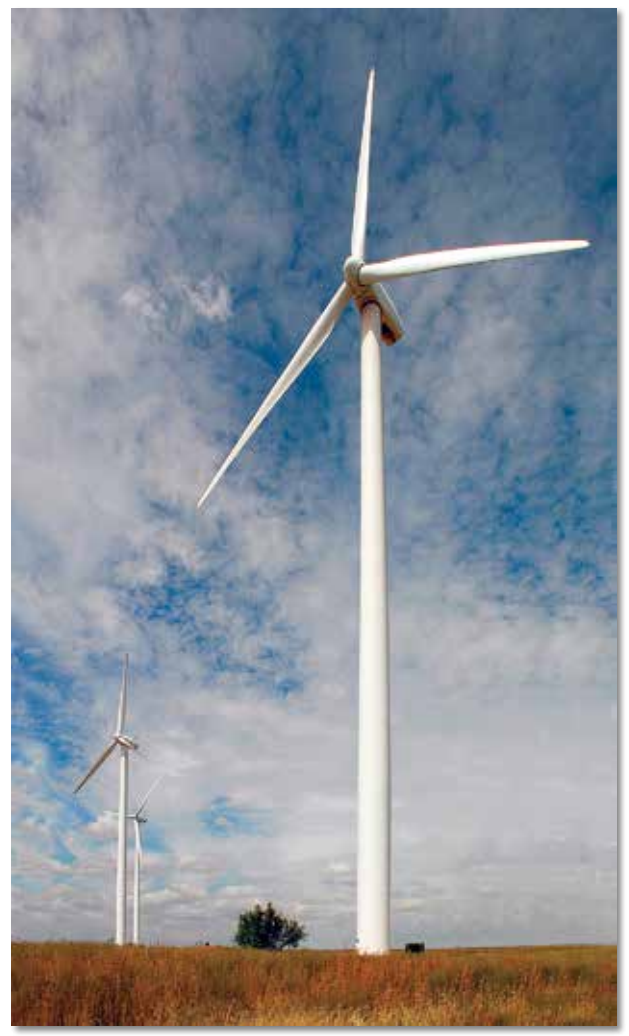
When finished next year, the PREP wind turbines will be located just south of these privately owned turbines already in service near Pantex.